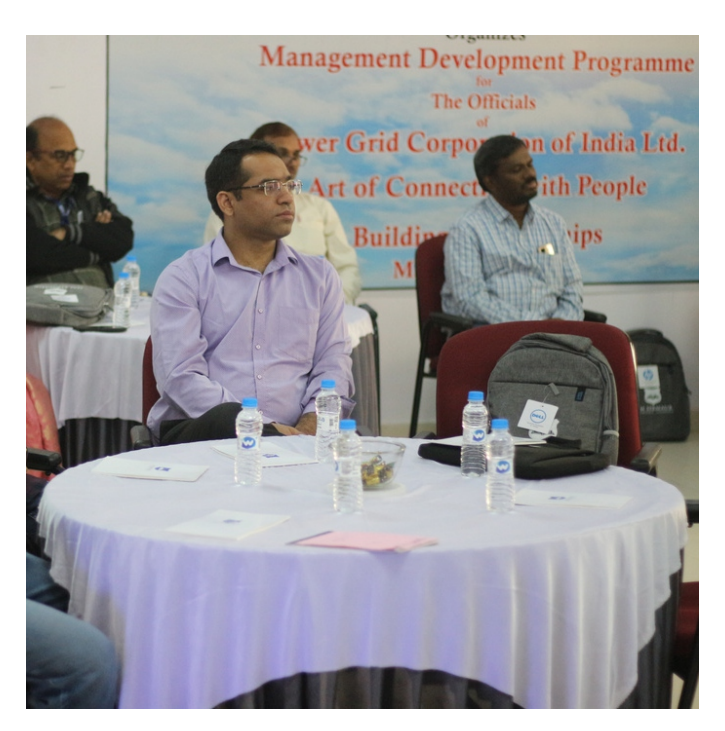
IIM Sirmaur MDP Experience