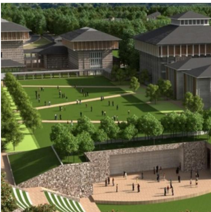
IIM Sirmaur Proposed Campus