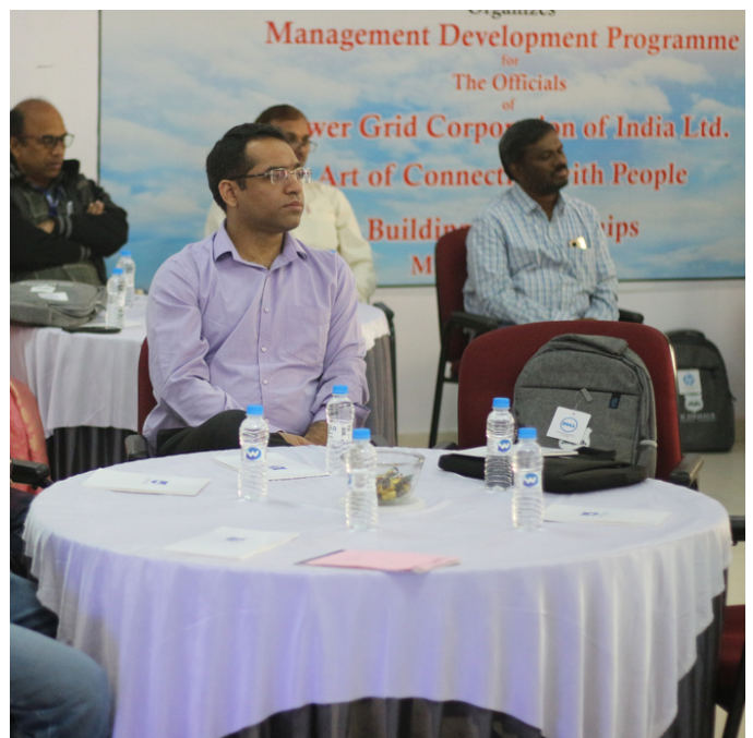
IIM Sirmaur MDP Experience