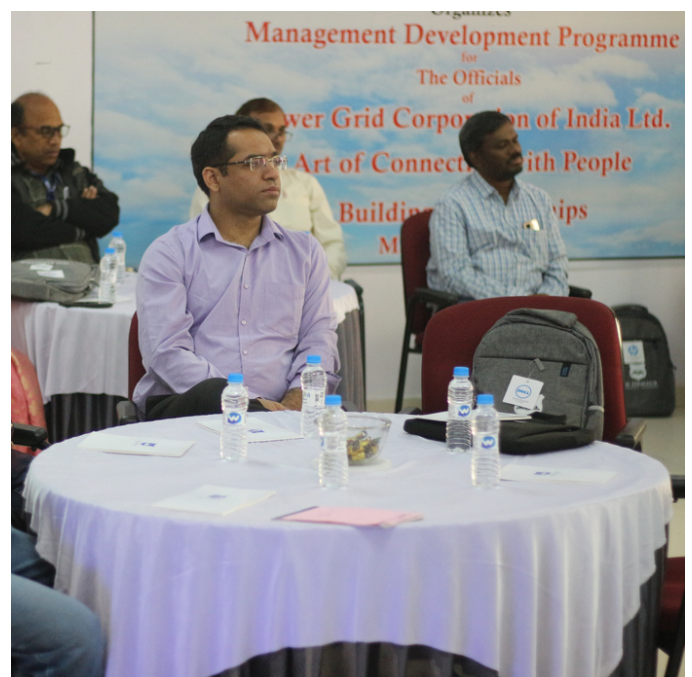
IIM Sirmaur MDP Experience