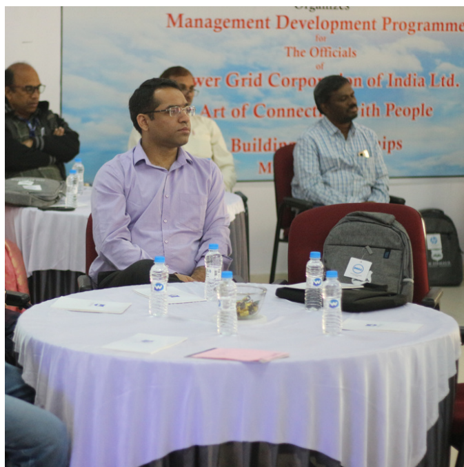
IIM Sirmaur MDP Experience