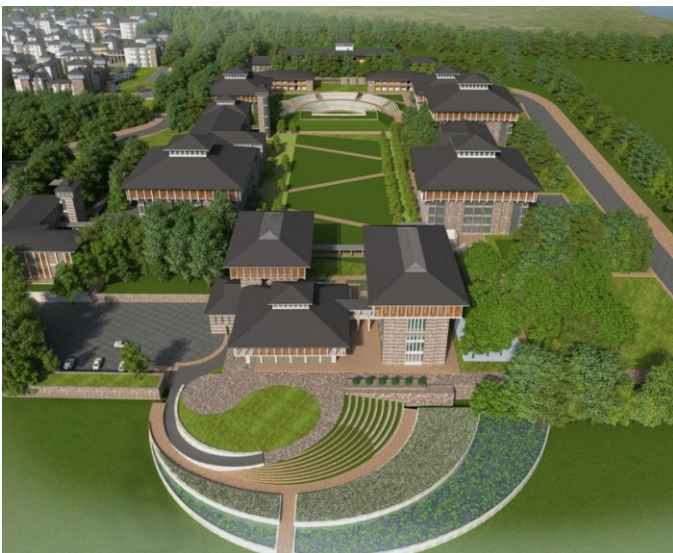
IIM Sirmaur Proposed Campus