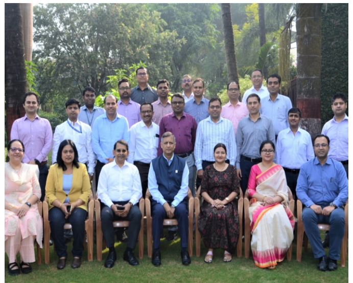
IIM Sirmaur MDP Experience